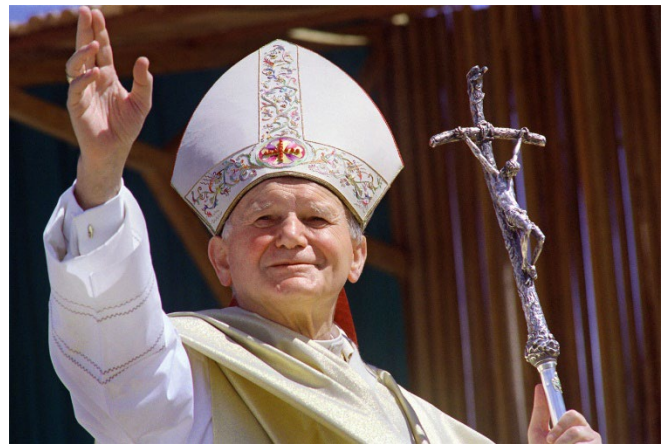
POPE JOHN PAUL II