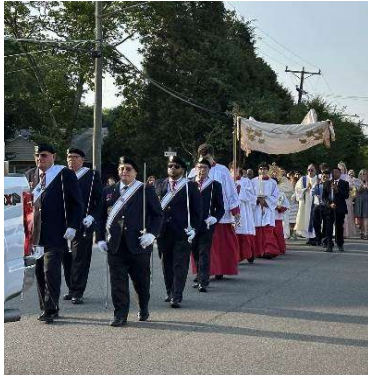
4 th Degree Honor Guard proudly leads the Corpus Christi procession and pilgrims