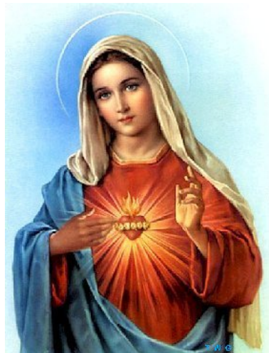
Solemnity of Mary, The Holy Mother of God January 1, 2021