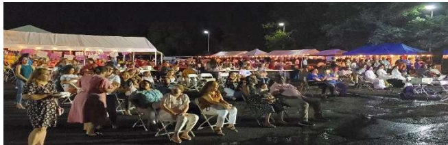
Parishioners, friends, and neighbors enjoying last year's festival.

also be needed on the day before to set up lights, tents, tables, etc. If you can help, setup will start on Friday, August 18 th , at 5:00PM. Hope you can help while also having fun at the festival!!!