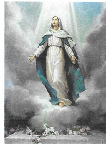
The Assumption of the Blessed Virgin Mary August 15 th