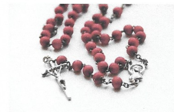
PRAY THE ROSARY